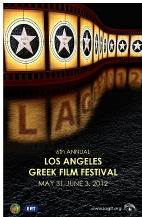
LAGFF 2012 Official Poster Final Tiny

Opening Night, May 31st, Egyptian Theatre, Hollywood